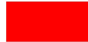
2160 PURE RED