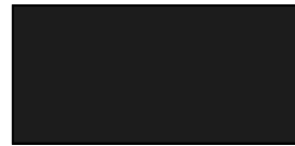
2900 PURE BLACK