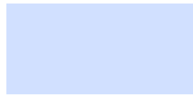
201 BABY BLUE