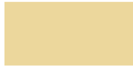
401 YELLOW BEIGE