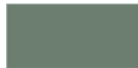
4591 LIGHT EMERALD GREEN