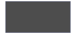
4848 DARK AGATE