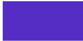
2200 PURE BLUE