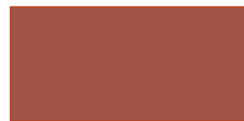
4711 DARK SCARLET