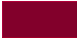
4853 CRIMSON RED