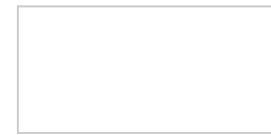
1000 PURE WHITE