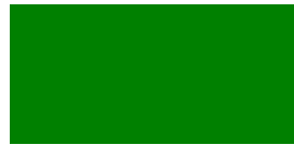
2300 DARK GREEN