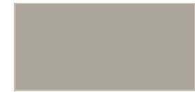
4473 DARK GRAY