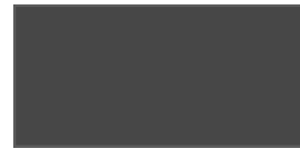
4124 DARK CHARCOAL