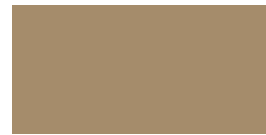
4839 LIGHT MOCHA