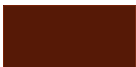
4563 CORDOVAN BROWN